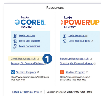
1 Core5 Resources Hub link on myLexia.com

Supplemental Comprehension Lessons allow you to extend instruction presented in Core5 and to supplement existing classroom instruction. The scripted routines in the Lessons can be used to introduce skills and concepts, and can also be used to provide instruction in additional literacy skills that are not specifically targeted in Core5 online activities. For example, you can use the Lessons to introduce additional literary genres, such as poetry, and to target skills such as comparing and contrasting ideas across multiple texts.